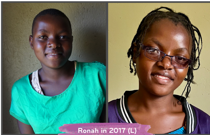
Ronah in 2017 (L) and in 2021 (R)

While the stories I share are only two of hundreds, they show the fuller picture of how God is providing ongoing, lasting, generational change amongst MCM children and our extended community.