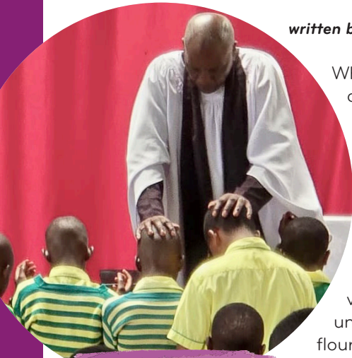
Prayer for candidates before their exams

What makes MCM different from many worthy child sponsorship programs? It's that they know, care for and guide sponsored children individually, and they support these kids through vocational school or university so that they can flourish as productive adults and pass along to others the blessings they have received.