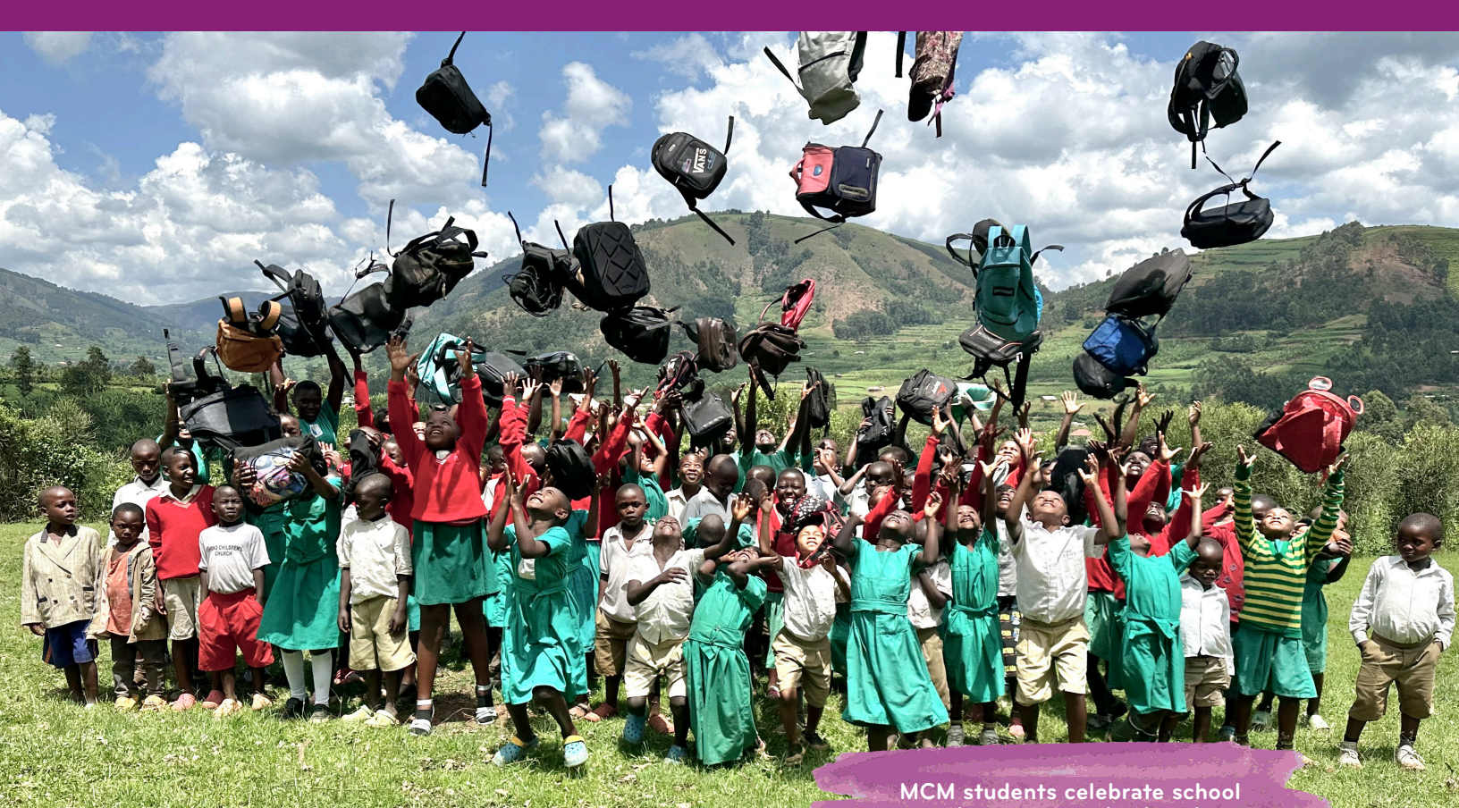
MCM students celebrate school and getting new backpacks