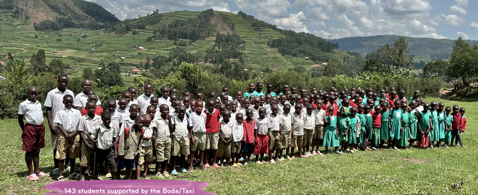
143 students supported by the Boda/Taxi Program independent of the West!!