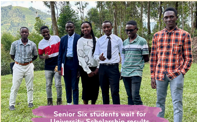
Senior Six students wait for University Scholarship results

Unemployment in Uganda is rampant, so MCM kids face stiff competition for jobs with Ugandan students who have had the advantages of growing up with both parents, financial stability in their homes, nutritious diets and more educational opportunities in the big cities. This means the additional few years of higher education are especially important for the young adults from our MCM peasant farming villages.