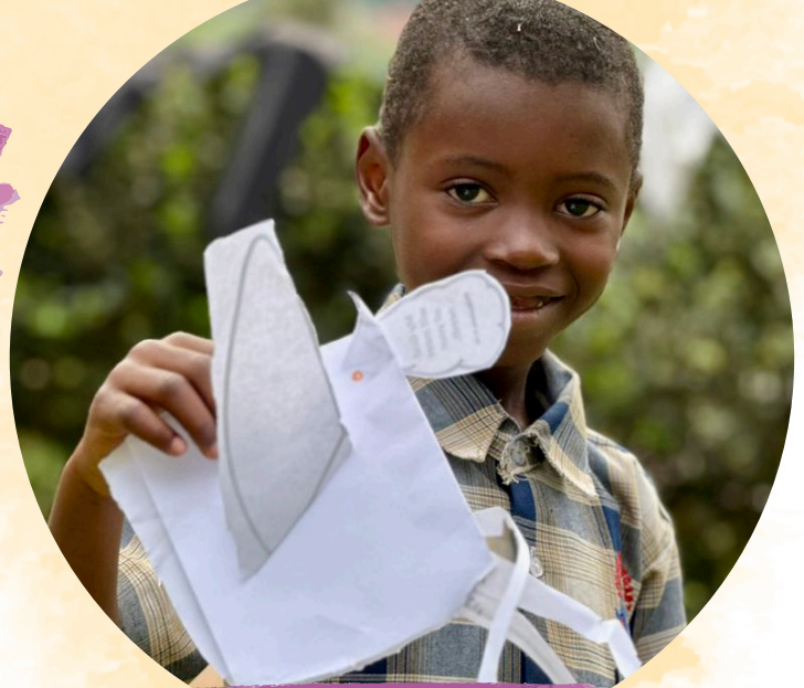
Bible craft Raven from 1 Kings 17:4-6, God will meet all your needs!

By God's grace, many MCM grads have started their careers, hired across our country! Some have stayed nearby to ensure the future of our village growing brighter as we educate and share God's love with younger children. Their desire is to give back! Qualified teachers, are now employed by some of our local schools and are educating