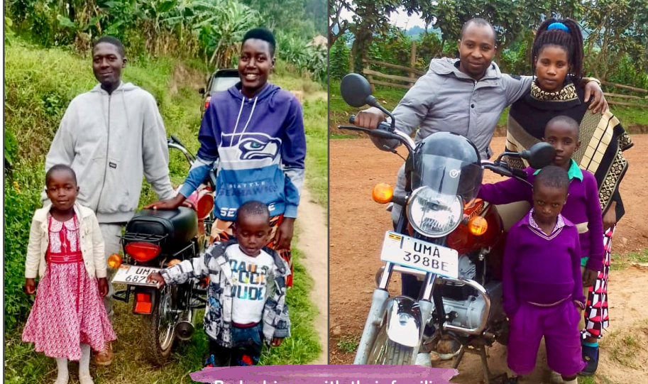
Boda drivers with their families

children. It is incredible the joy a child gets when she/he gets a letter from their sponsor. It makes them feel treasured, remembered and important. The truth is, our children never feel this during their young lives from their guardians. A letter from a sponsor, however short, carries such importance for them that many keep these letters and pictures for years! They are memorable and a source of inspiration. Knowing that someone has taken time they did not have to do something for you is touching. So, on behalf of our children I thank you!