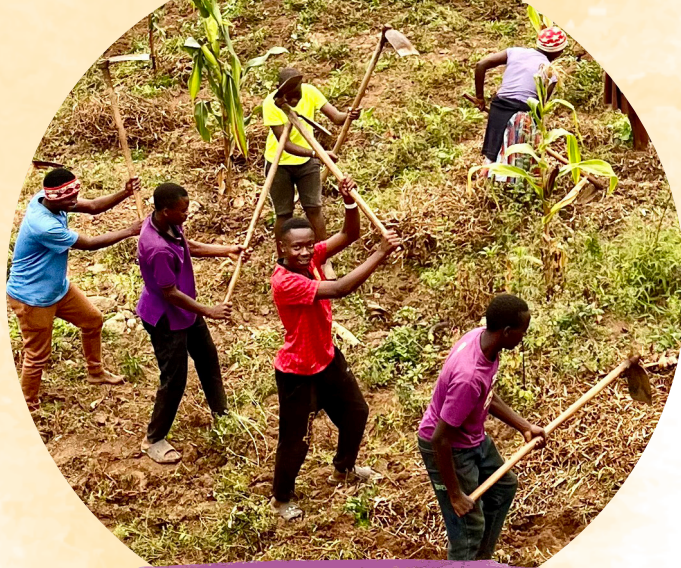
MCM students help to harvest sorghum during their holiday

hotel and catering, one agriculturalist, one in tours and hospitality, one tailor, two hair designers and one social worker. We pray they will improve our community, working ethically and with integrity which is one of the missing traits in our leaders here.