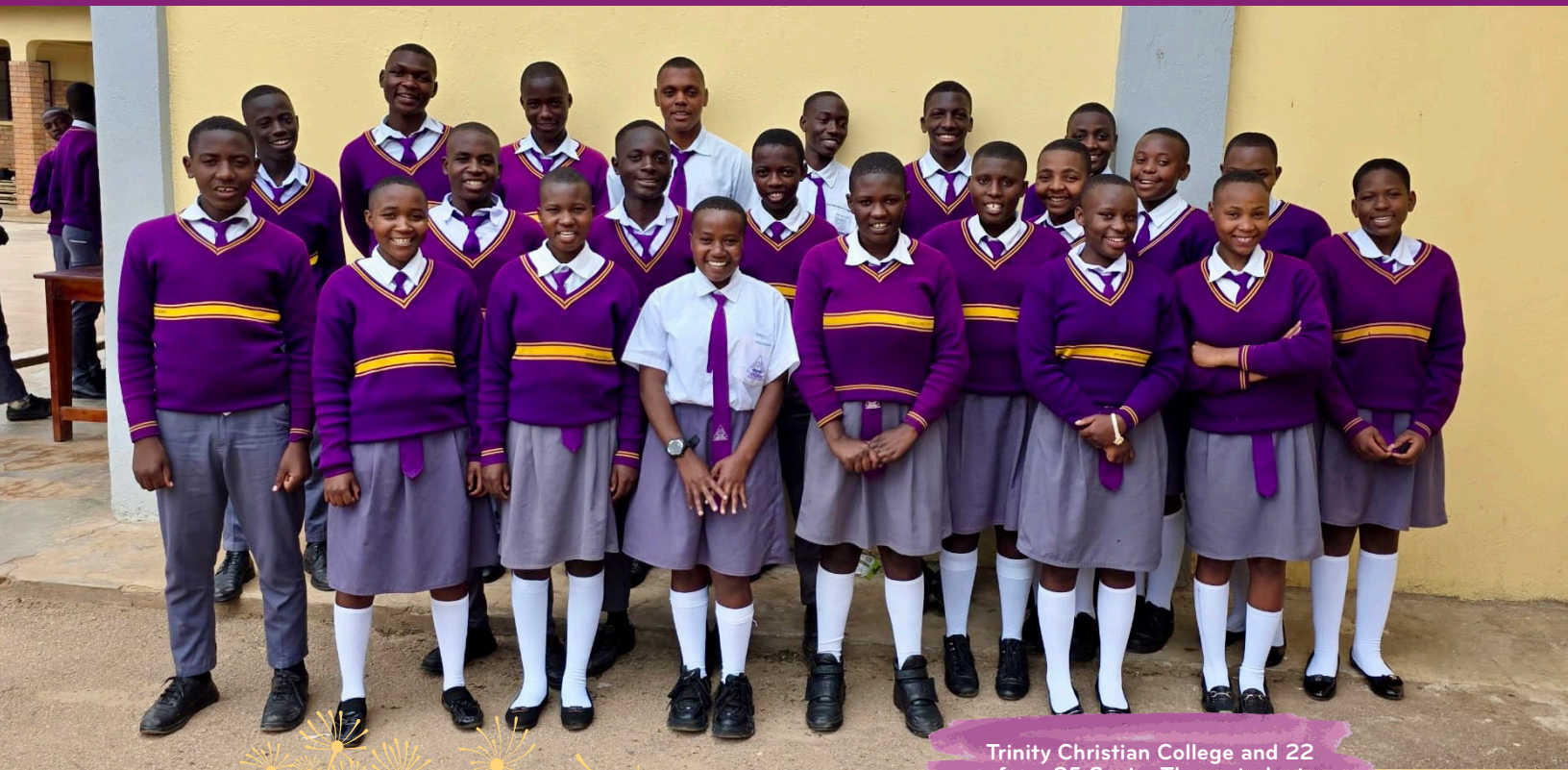
Trinity Christian College and 22 of our 25 Senior Three students