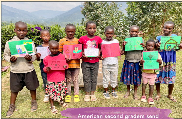
American second graders send Christmas cards to our students.