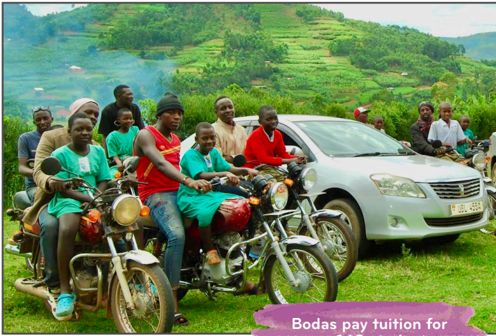
Bodas pay tuition for over 140 students.

Our farming program is also doing well. It continues to bring us steady income from our banana plantation and our crops of beans, potatoes and sorghum. Thank God for that!