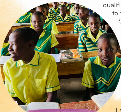
Boarding improves education!

I am happy to report that the Boda/Taxi program is doing well and is still expanding. We are now at 23 Bodas and 3 Taxis. I also want to thank the Self Sustainability donors for their generous support towards this project. It has really had a profound impact on helping this organization achieve many objectives that it would have otherwise struggled to complete. Many children are benefiting academically with tuition and school needs. The bodas and taxis make medical help accessible by acting as "ambulances" for the children and our community members that need rapid transit. Plus over 26 people in our community are now gainfully employed as drivers of our vehicles.