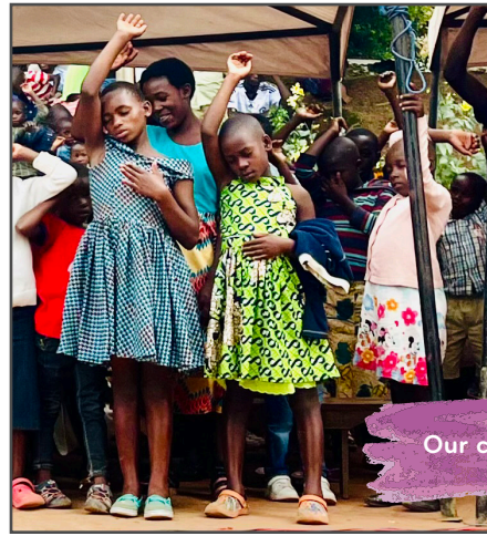
Our children pray!

Our farming program is also doing well. It continues to bring us steady income from our banana plantation and our crops of beans, potatoes and sorghum. Thank God for that!