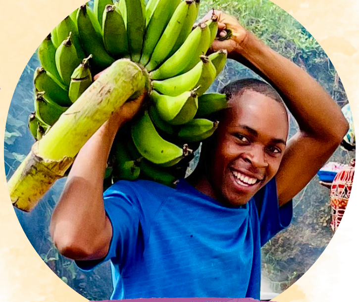
Our banana plantation continues to bless us.

A few things have been happening this year and I would like to share them with you.