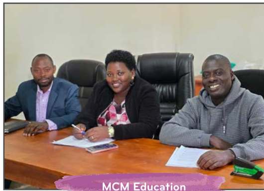
MCM Education Committee Extraordinaire

Another great source of knowledge and instruction has been the MCM Education Committee. This group is responsible for counseling our students in making the best choices for their future occupations. These Educators have been providing objective advice on what vocations are best for our country which offers few jobs. The Committee meets students after their national exams (S.4 and S.6) then advises, based on exam performance, interviews, student strengths, passions for employment and job availability. MCM is much in debt to these dedicated Ugandan volunteers for their invaluable help both to our organization and our students who struggle to make educated decisions about their future.