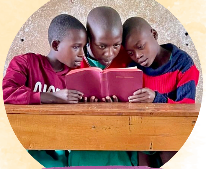
Library students reading