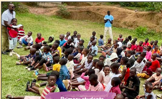
Primary students Bible study

Most importantly in our children's health is their Spiritual growth! Each month Bible studies are attended by either young children (3-8yrs) or older students (10-24 yrs)